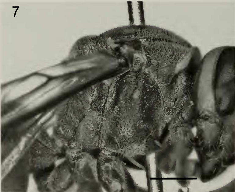
Figs 1-8. Continued.